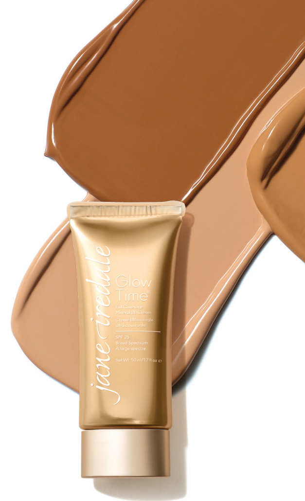
Glow Time® Full Coverage Mineral BB Cream