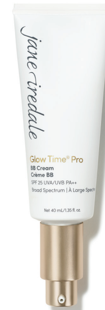
NEW! Glow Time® Pro BB Cream

The Glow Time® BB Cream you love has been reinvented with a fresh look and new 'pro' formula.