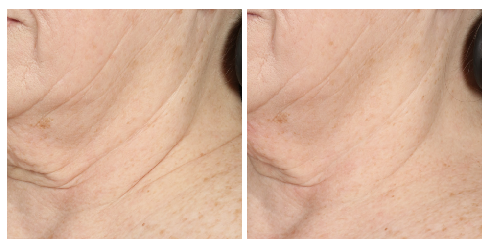
AFTER APPLIED TWICE A DAY FOR 12 WEEKS

PHOTOS HAVE NOT BEEN RETOUCHED. INDIVIDUAL RESULTS MAY VARY.