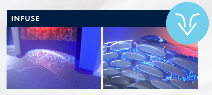
Proven Obagi products are rapidly distributed to absorb into the skin.