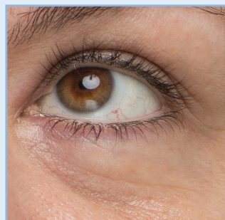
Immediately After 1 Application