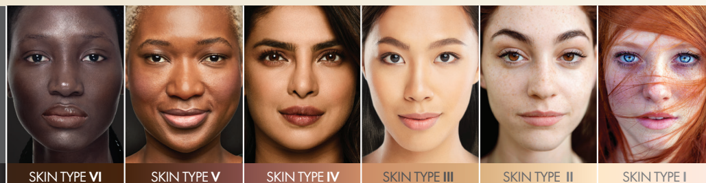
SKIN TYPE VI

Skin can vary in many ways, and one way dermatologists categorize skin is based on the Fitzpatrick Skin Spectrum, which is broken up into six categories based on how skin responds to ultraviolet (UV) light.